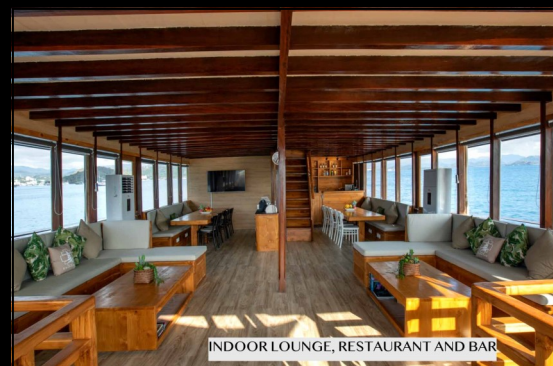
INDOOR LOUNGE, RESTAURANT AND BAR